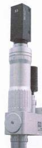
DZ4-T Manual Type

In order to make its body compact, illumination is located at front or back