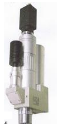
DZ4-E Motorized Type